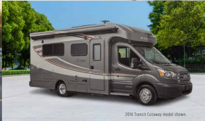
2016 Transit Cutaway model shown.

Computer-generated images with optional features and/or aftermarket equipment shown throughout.