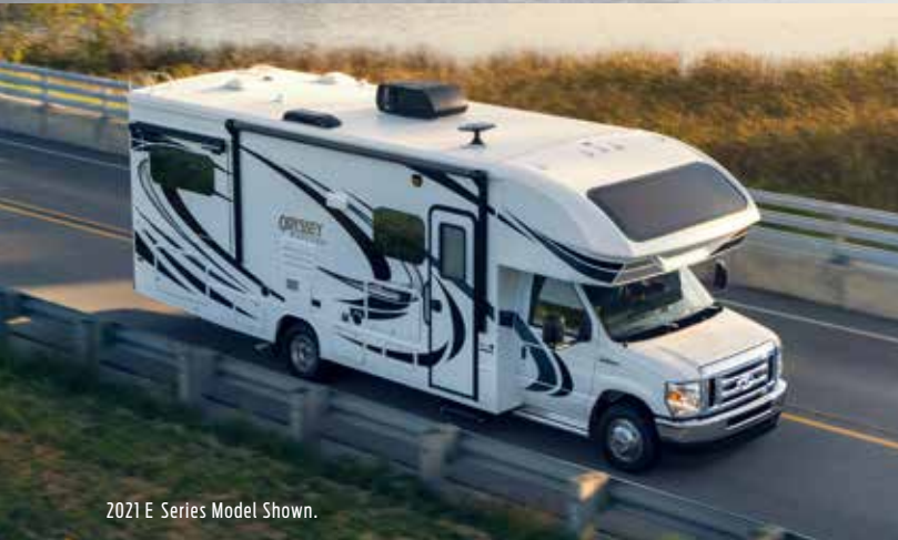
2021 E Series Model Shown.